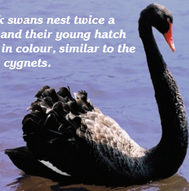
Black swans nest twice a year and their young hatch light in colour, similar to the mute cygnets.

Every swan on the Avon is micro-chipped and wears a leg band bearing an identification number that is registered with Environment Canada.