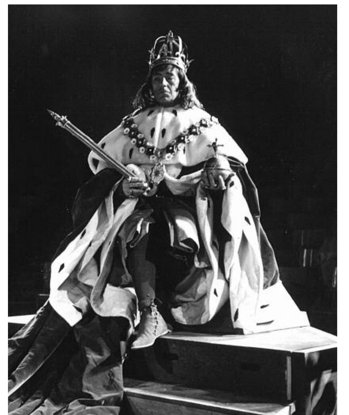
ERECTING THE STRATFORD FESTIVAL TENT, 1953; IRENE WORTH WITH COMPANY MEMBERS IN AS YOU LIKE IT , 1959; SIR ALEC GUINNESS IN THE TITLE ROLE OF RICHARD III , 1953.